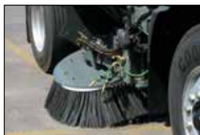
In-cab side broom tilt and extended reach