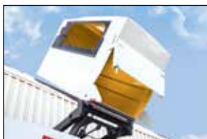
Lifeliner® hopper system